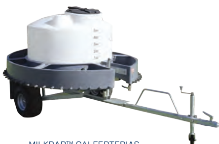
MILKBAR™ CALF FERTERIAS