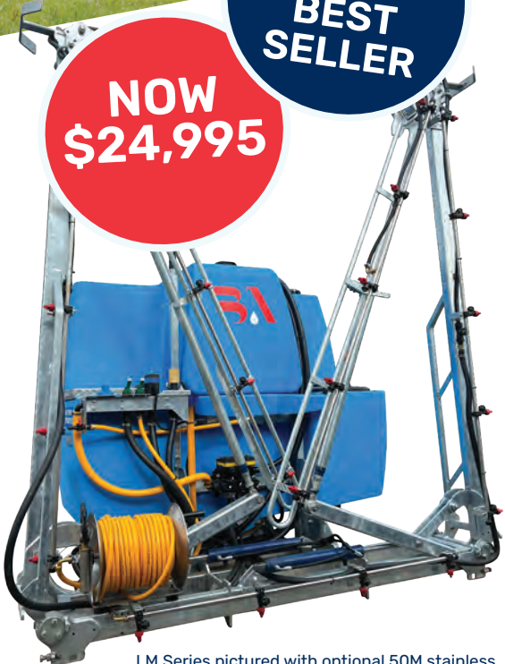
LM Series pictured with optional 50M stainless steel hose reel available for $1,295 fitted exc GST.

HALF PRICE ADD A FOAM MARKER FOR ONLY $995 PART #520004-F